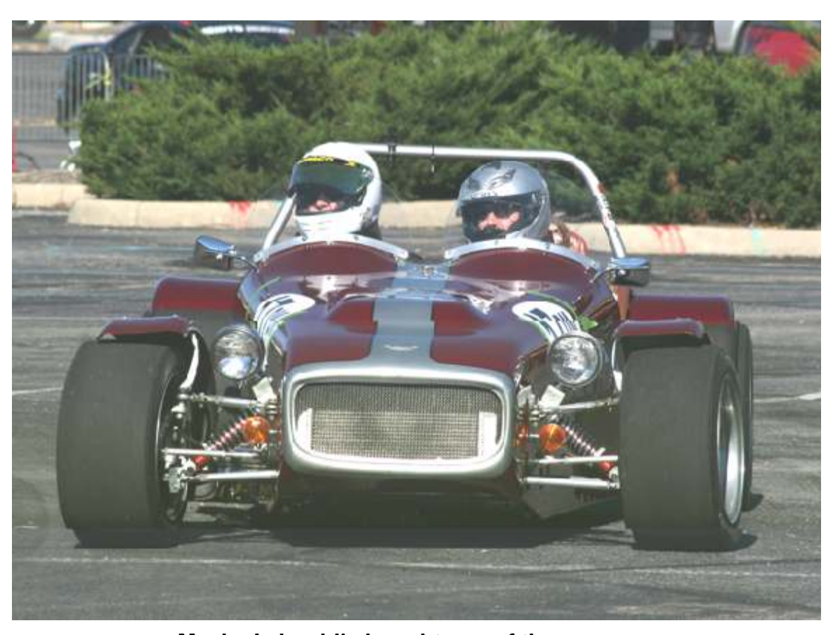
Maybe I should'a bought one of these